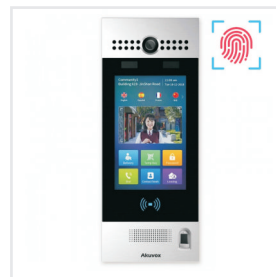
Akuvox - R29CT SIP Touchscreen Intercom with Face Recognition, Voice Commands and Fingerprint Reader