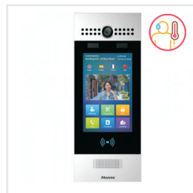
Akuvox - R29C-B SIP Touchscreen Intercom with Face Recognition, Voice Commands and Thermal Detection