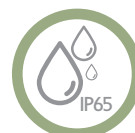
IP65 PROTECTION RATING