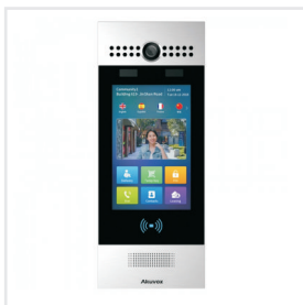
Akuvox - R29C SIP Touchscreen Intercom with Face Recognition, Voice Commands and QR Code Scanner