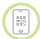
QR CODE SCANNER